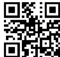
UBC Mobile App